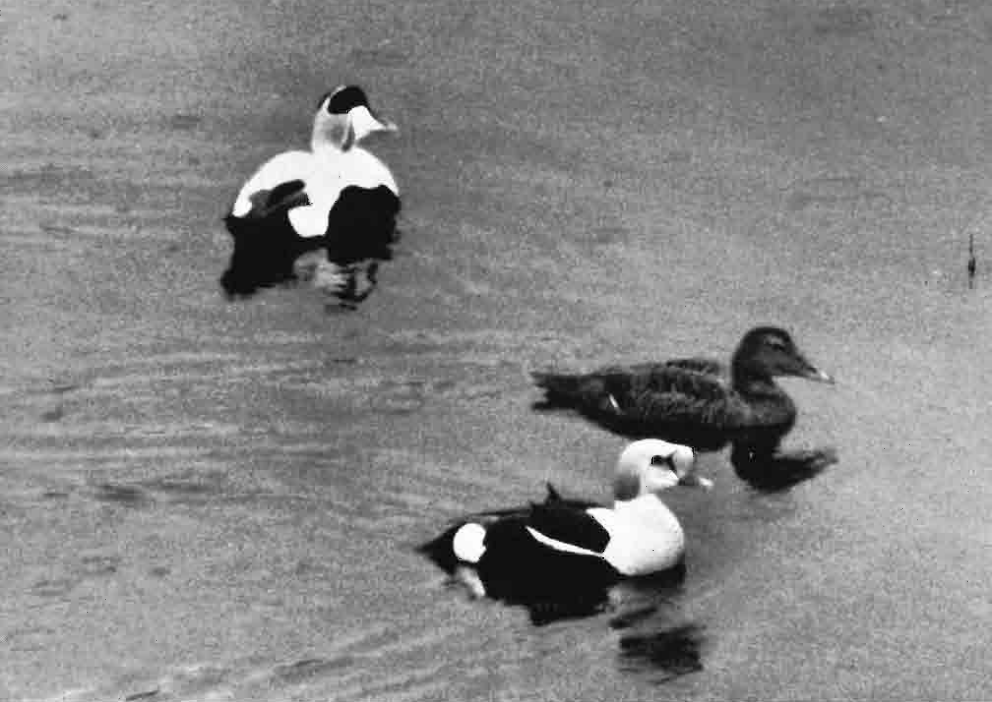
PLATE 6. (a) King Eider, drake with pair of common Eider, Ronas Voe 18 April-7 May 1969, an almost annual visitor to Shetland in recent years.