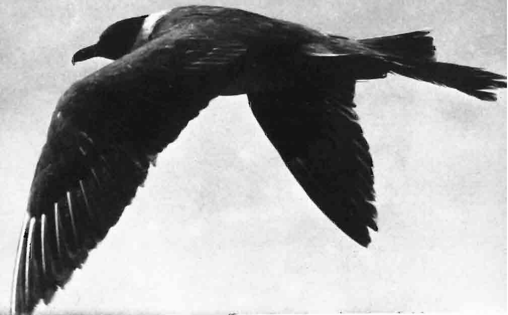
PLATE 7. (a) Pomarine Skua, Scalloway, Shetland, a bird which was present 17-25 June 1969.

(b) Red-footed Falcon, first-year male on Yell, Shetland, 30 May to about 9 June 1969 ( Scot. Birds (6): 39).