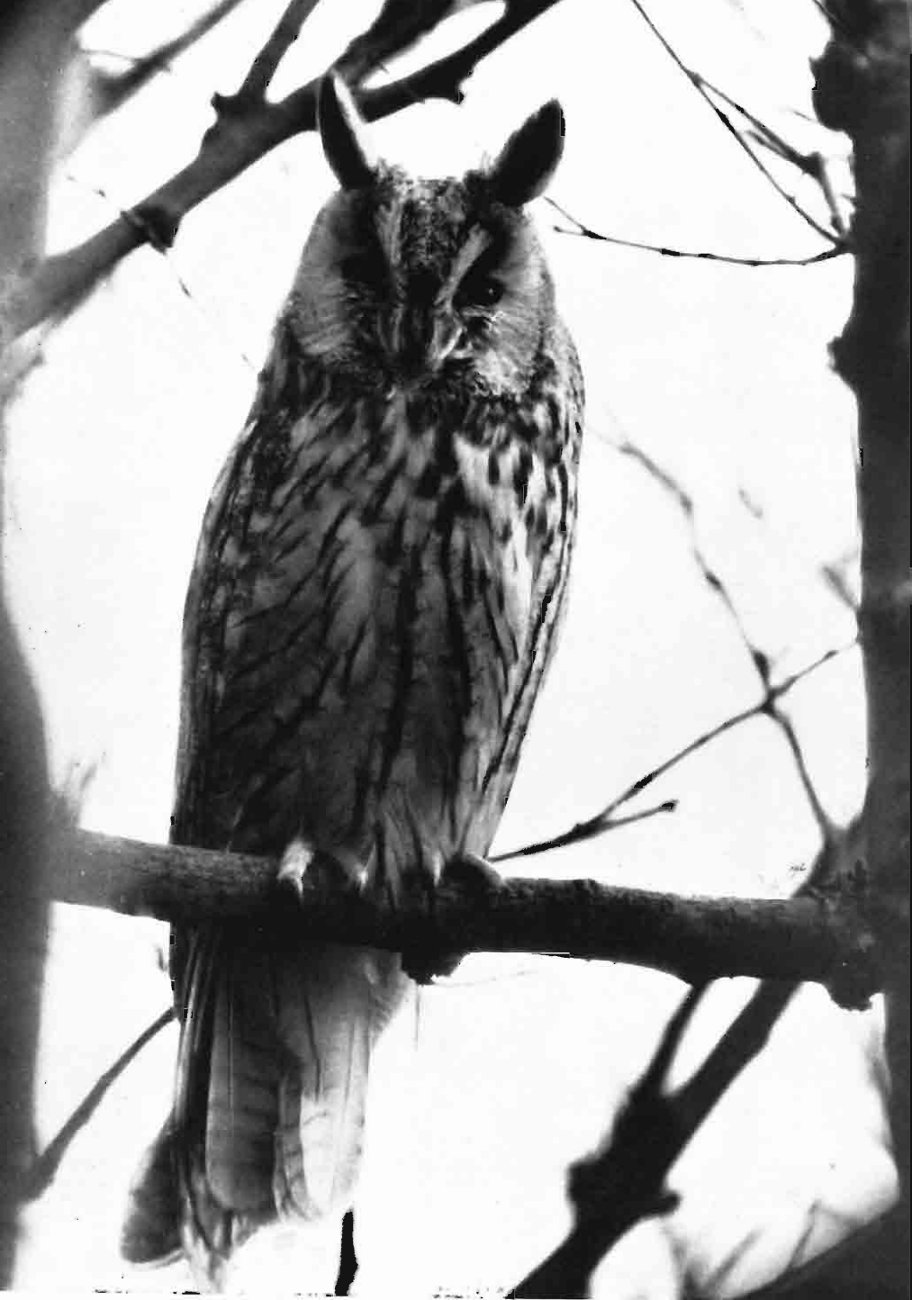
PLATE 8. Long-eared Owl, one of up to nine which roosted regularly in gardens in Scalloway, Shetland, during the winter months of 1969 and previously.